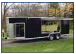
Enclosed Car Trailers