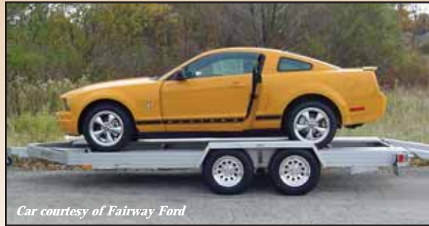
Car courtesy of Fairway Ford