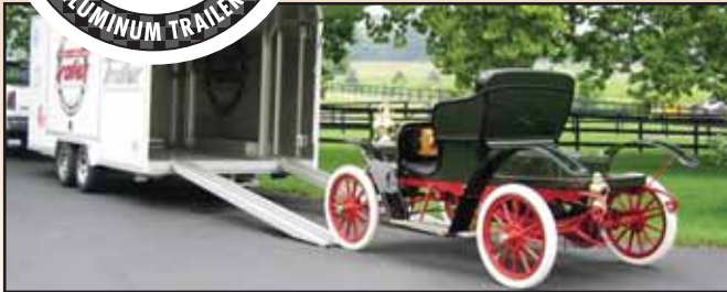
Traillex's own 1908 Cadillac Model S Roadster. 1st Junior, Senior, Grand National, Grand National National Winner only travels in a Traillex enclosed car Trailer.