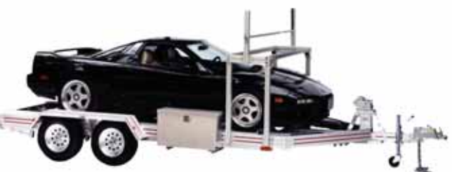
Shown with aluminum wheels, storage box, tire rack and manual winch