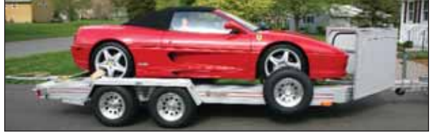
Spare Tire, Front Shield and Aluminum Wheels