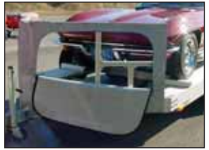
Front Shield (shown unzipped)