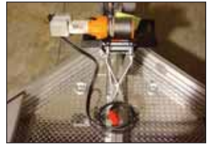
Electric Winch, Aluminum Floor