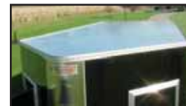
One Piece Aluminum Roof

For more details talk with our specialists.