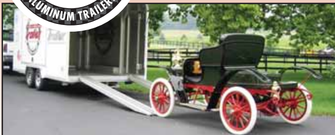
Traillex's own 1908 Cadillac Model S Roadster. 1st Junior, Senior, Grand National, Grand National National Winner only travels in a Traillex enclosed car Trailer.