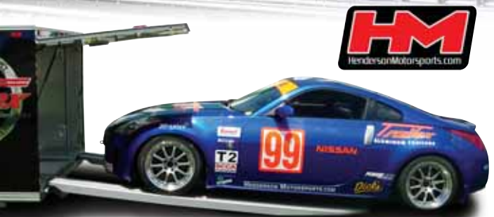
THE OFFICIAL SPONSOR OF HENDERSON MOTORSPORTS NISSAN 350-Z