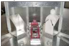
Fuel Jug and Jack Storage