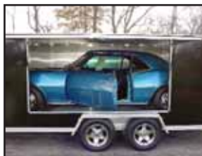
Standard Side Door