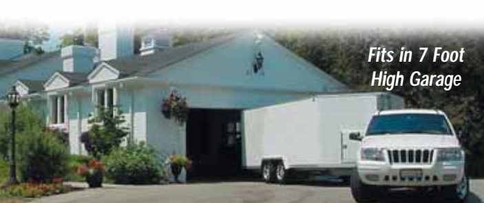
Fits in 7 Foot High Garage