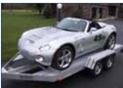
Open Car Trailers