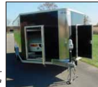
Exclusive "Aero" Front Design