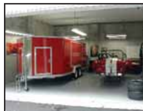
Built to Fit in Your Garage