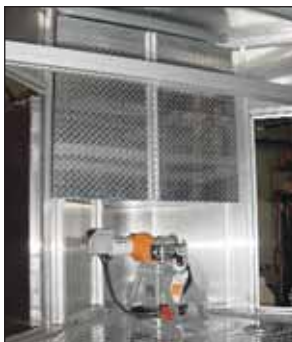
Front Locker and Winch