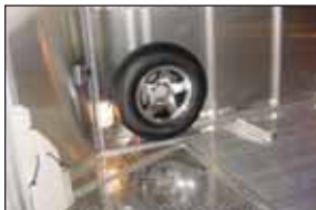
Spare Tire and Carrier

HANDBUILT EXTRAS FOR YOUR INDIVIDUAL NEEDS