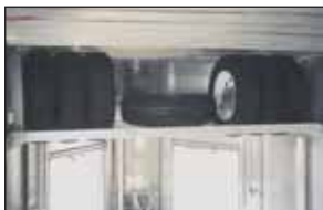
Internal Tire Rack