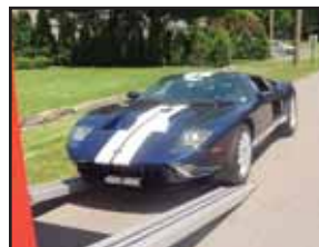
11' Ramps for Low Clearance

HANDBUILT EXTRAS FOR YOUR INDIVIDUAL NEEDS